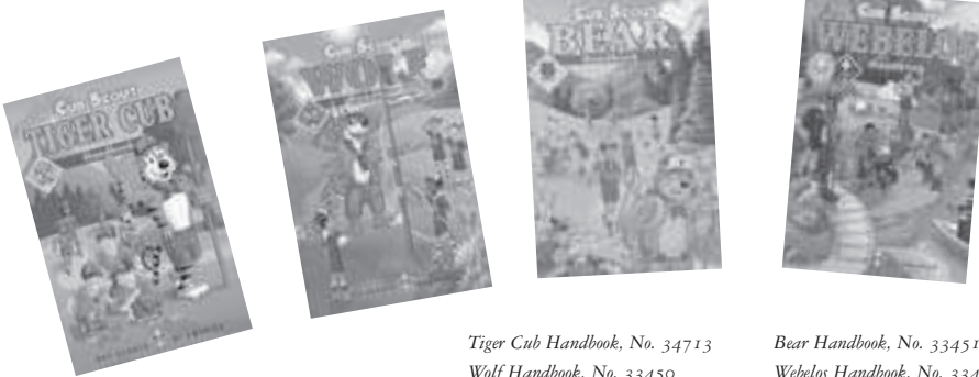
Tiger Cub Handbook, No. 34713 Wolf Handbook, No. 33450